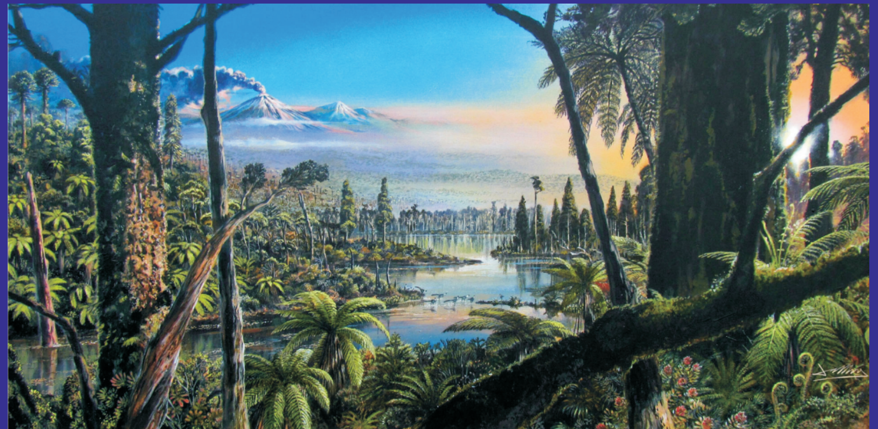
Reconstruction of the West Antarctic mid-Cretaceous (90 Ma) temperate rainforest.