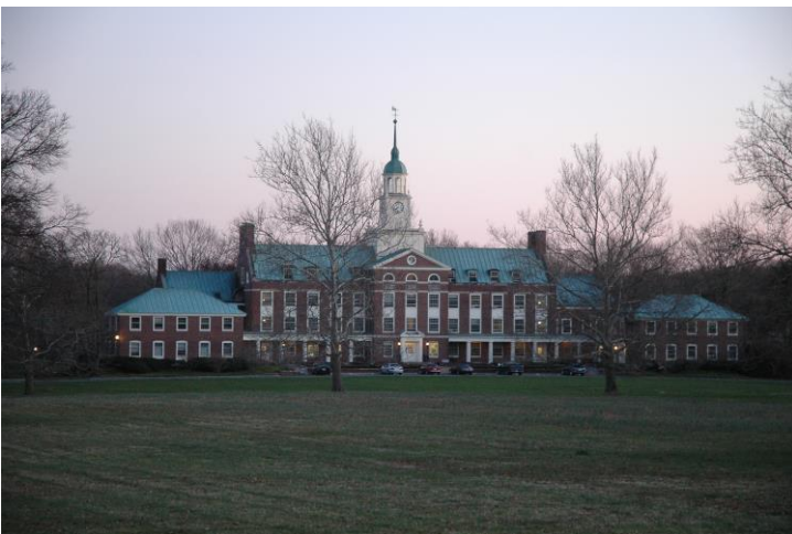
← Institute for Advanced Studies Princeton