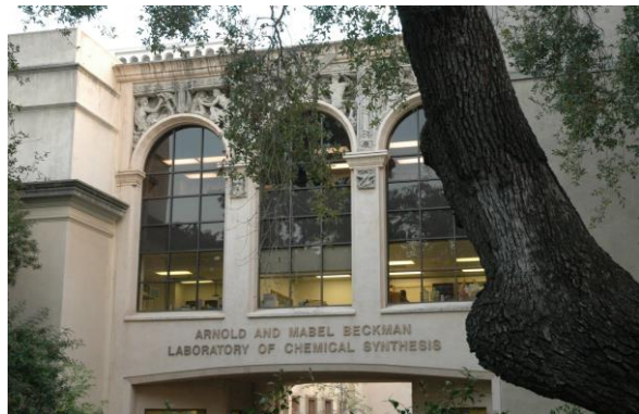
Caltech - Chemistry