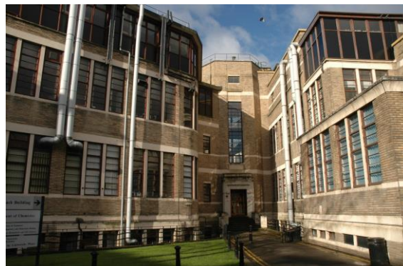
Joseph Black Building (Chemistry)