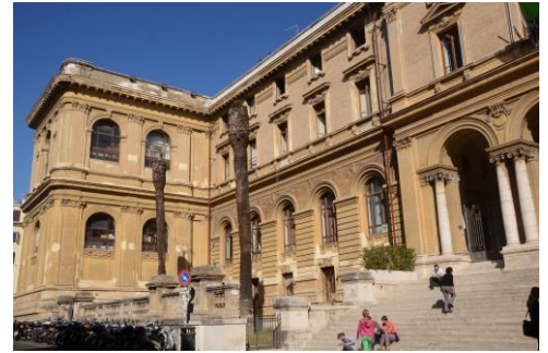
La Sapienza – Old Building