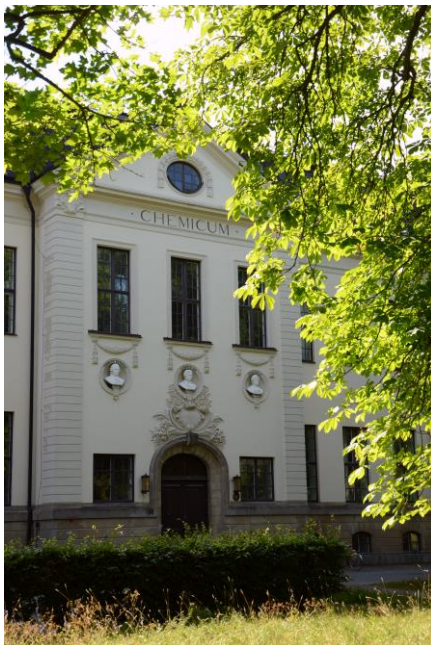
Chemicum – Old Chemistry