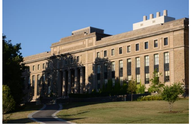
Baker Lab (Cornell)