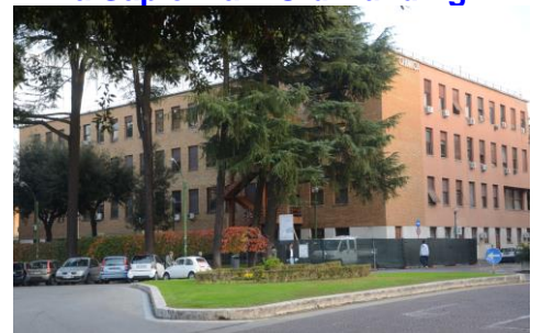
Cannizzaro Chemistry Dept.