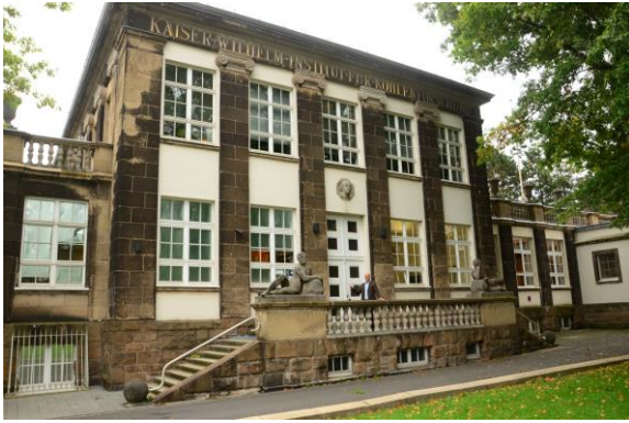
Max Planck Institute Mülheim