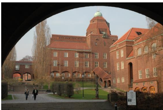
KTH - Royal Institute Stockholm