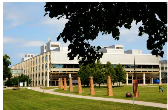
Stockholm University - Arrhenius Lab