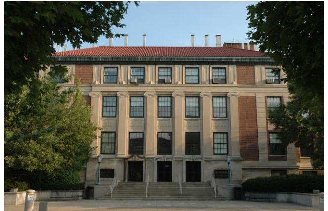
Purdue University - Chemistry