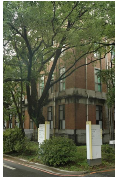
NTU – Old Chemistry