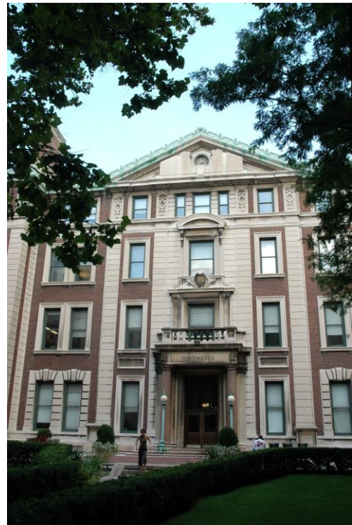
Columbia University - Chemistry