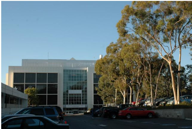
Scripps Institute (California)