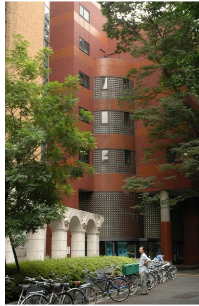
Tokyo - Chemistry