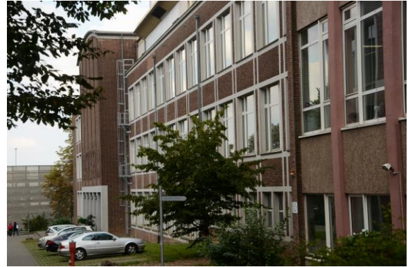
RWTH Aachen - Chemistry