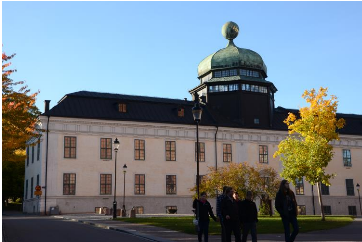
Gustavianum – Original Univ. Building