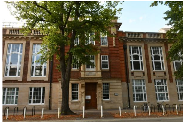
Dyson Perrins Lab (Chemistry)