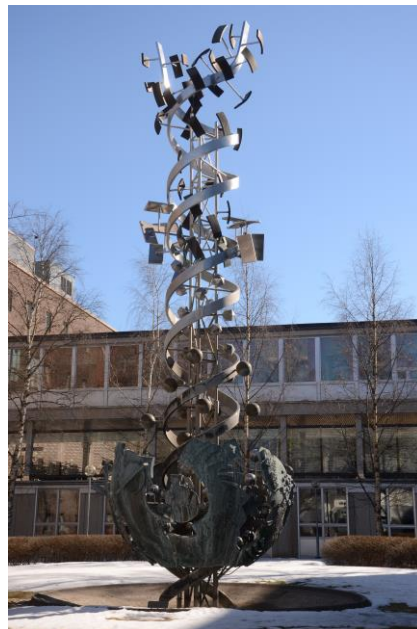
Biomedical Center (BMC)