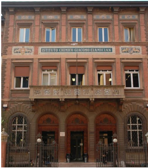
Ciamician Chemistry Inst