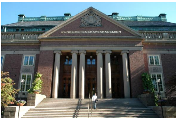
Royal Academy Stockholm