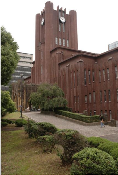
Tokyo University – campus