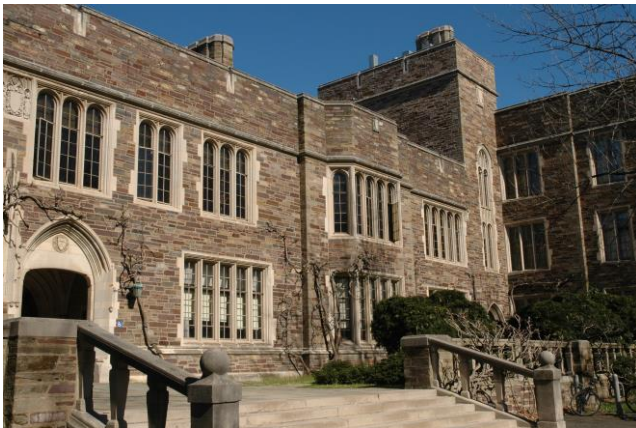
Princeton University - Chemistry Dept.