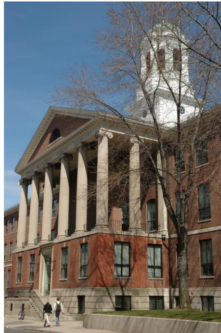
Mallinckrodt Building (Chemistry)