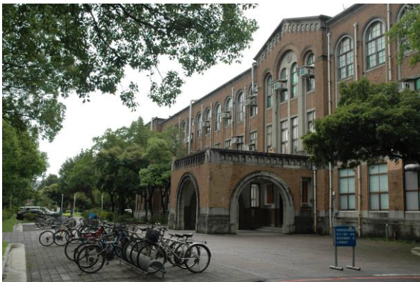
National Taiwan University (NTU) campus