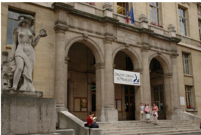
Ecole Nationale Supérieure de Chimie