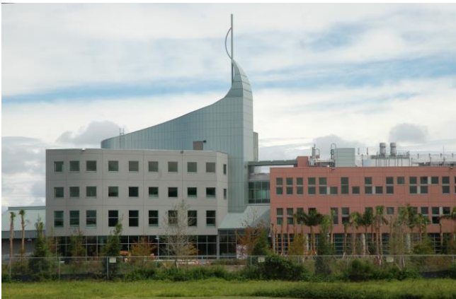
Scripps Institute (Florida)