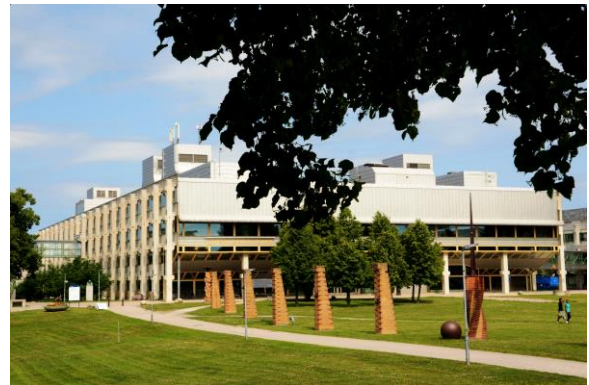
Stockholm University - Arrhenius Lab