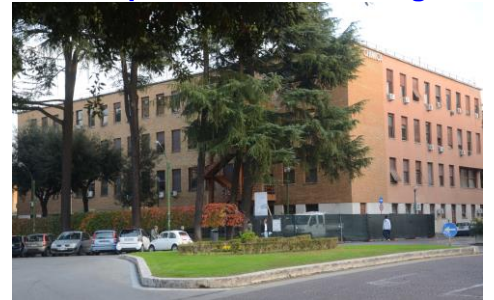
Cannizzaro Chemistry Dept.