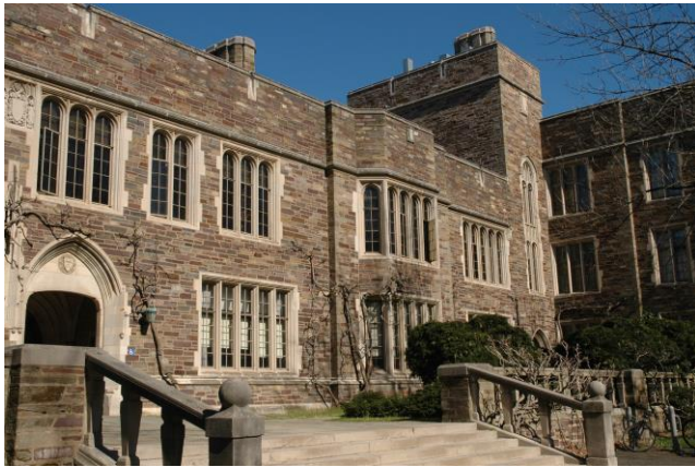
Princeton University - Chemistry Dept.