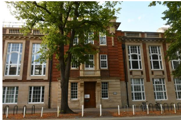
Dyson Perrins Lab (Chemistry)