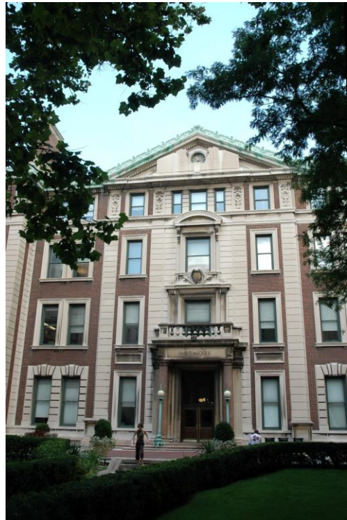
Columbia University - Chemistry