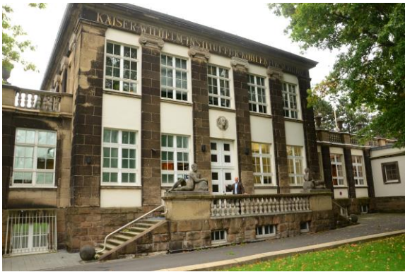
Max Planck Institute Mülheim