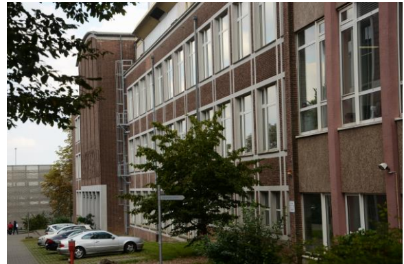
RWTH Aachen - Chemistry