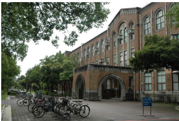
National Taiwan University (NTU) campus