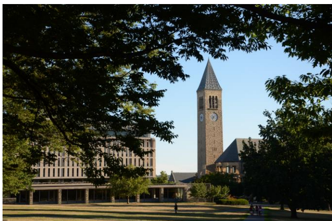
Cornell University - Campus