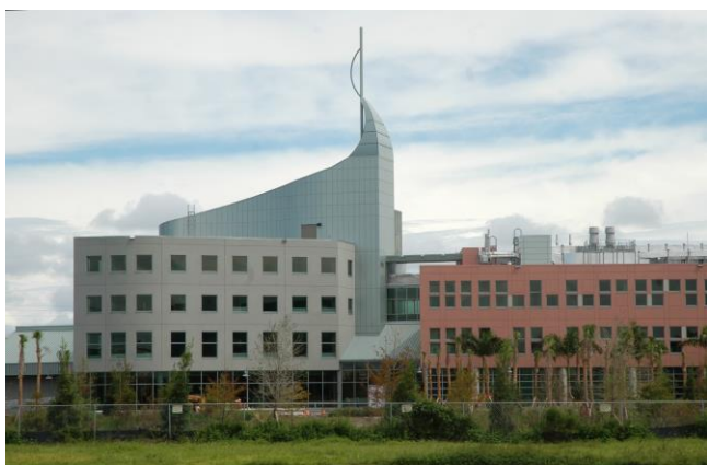
Scripps Institute (Florida)