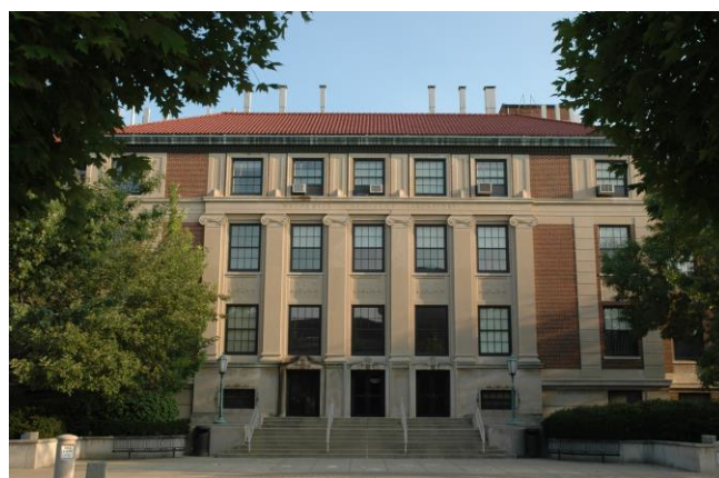
Purdue University - Chemistry