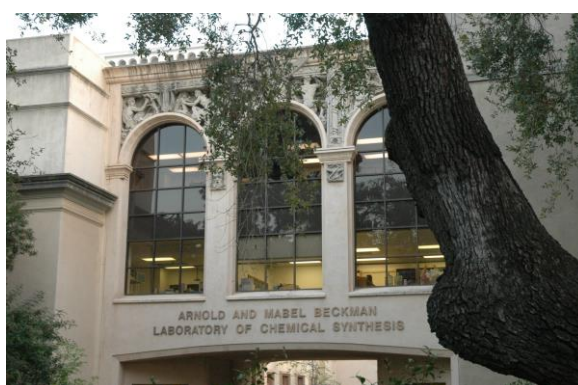
Caltech - Chemistry