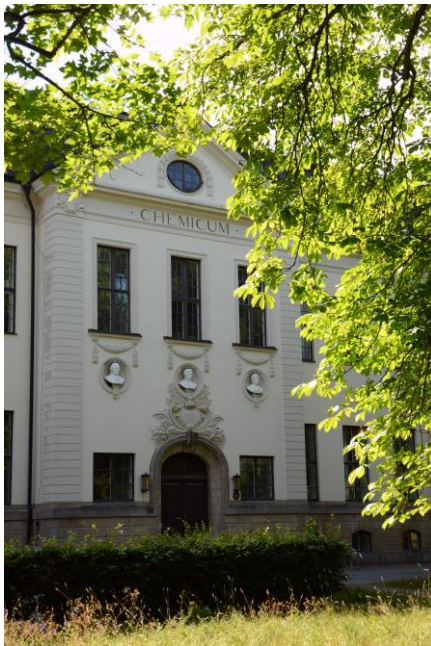
Chemicum – Old Chemistry