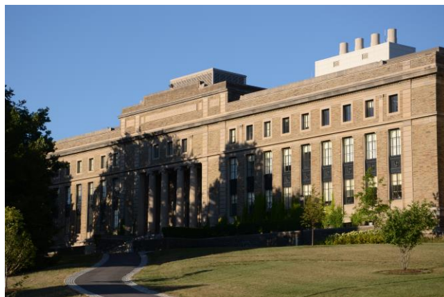
Baker Lab (Cornell)