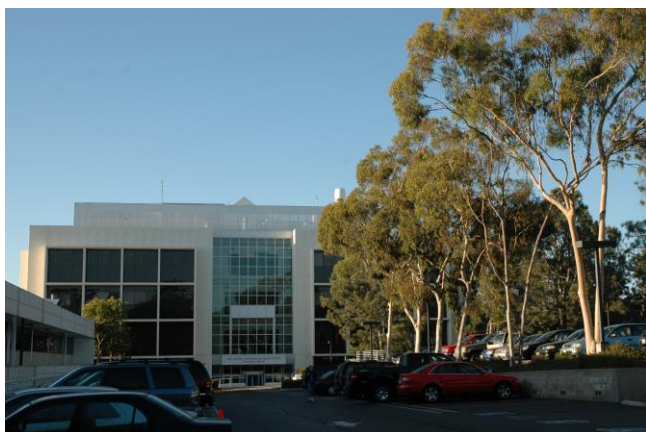
Scripps Institute (California)