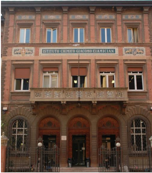
Ciamician Chemistry Inst