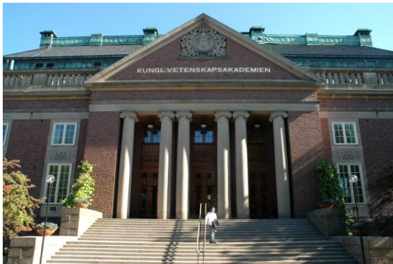
Royal Academy Stockholm